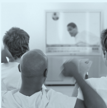
Watching TV at home