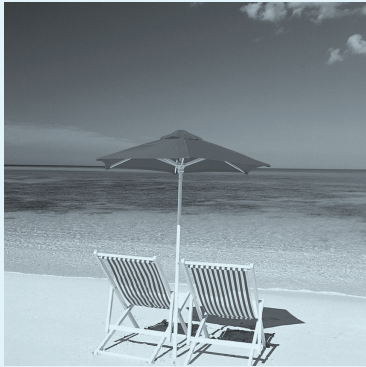
At the beach