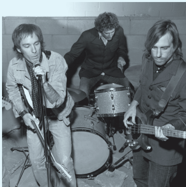
At a pop concert