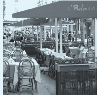
At a restaurant