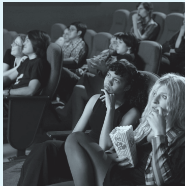
At the cinema