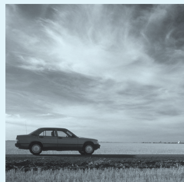
Driving my car