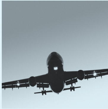
On an aeroplane