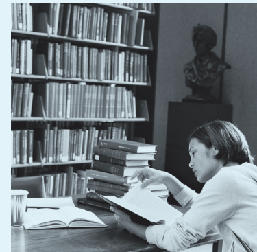
At the library