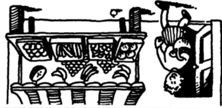
THE GENEROUS GREENGROCER