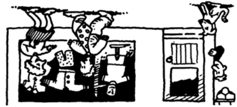
THE COLOUR CLOTHES SHOP