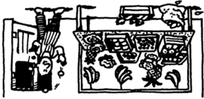
THE GREEDY GREENGROCER