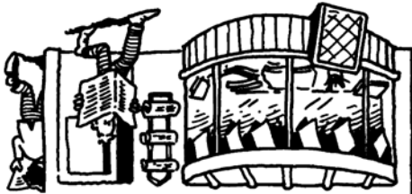
THE NEW NEWSAGENT