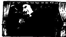
4. HORROR FILM