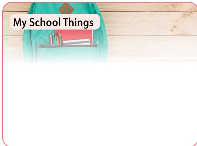
My School Things