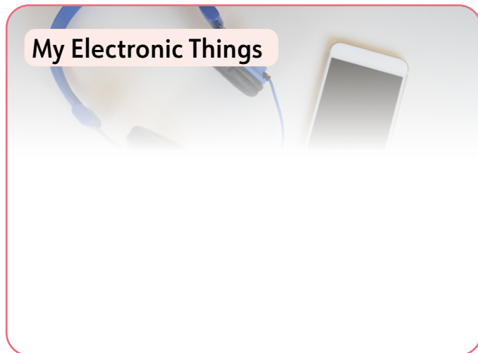
My Electronic Things