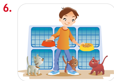
_____ animals at a shelter.