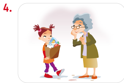
_____ bags for someone.