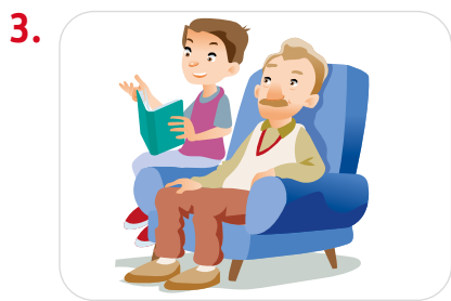
_____ an older person.