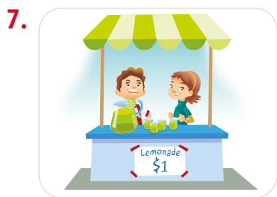
_____ money for a cause.