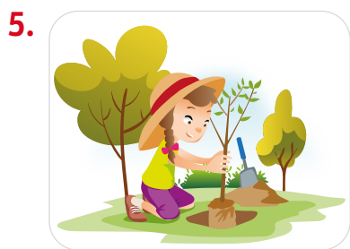
_____ a tree in a park.