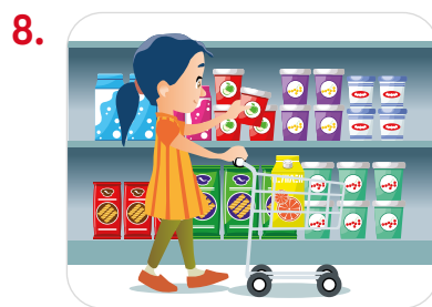
_____ food for hungry people.