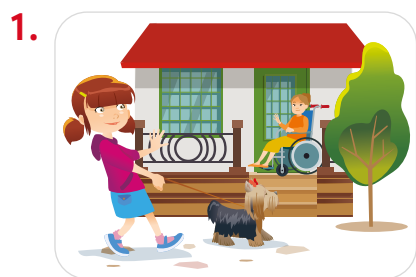
_____ someone's dog.

Carry Collect Feed Pick up Plant Raise Visit Walk