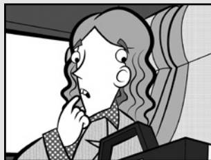
Suitcase in view. On the train. Focus on Katie looking shocked. Looking at something out of scene.