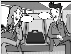
On the train. Katie and Nick sit down next to each other. [Dialogue]