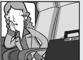
On the train. Focus on Nick's briefcase and name.