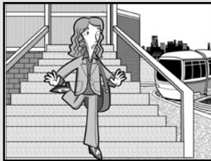
At the train station. Katie running down the stairs. Train moving away in the background.