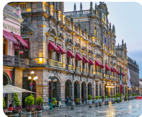
The Historic Center of Puebla, Mexico

B. Can you name any other World Heritage Sites? Share them with the class.