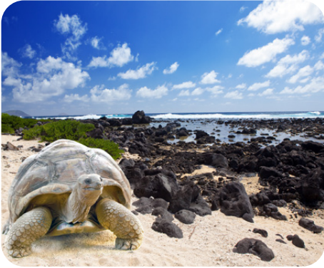
The Galapagos Islands, Ecuador

A. UNESCO protects World Heritage Sites,, places that are important for historical, geographical, or cultural reasons. Check (✓) the places you think are UNESCO World Heritage Sites.