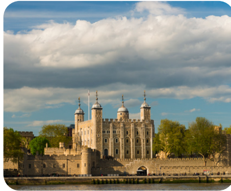
The Tower of London, England