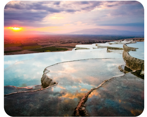
The natural pools of Pamukkale, Turkey