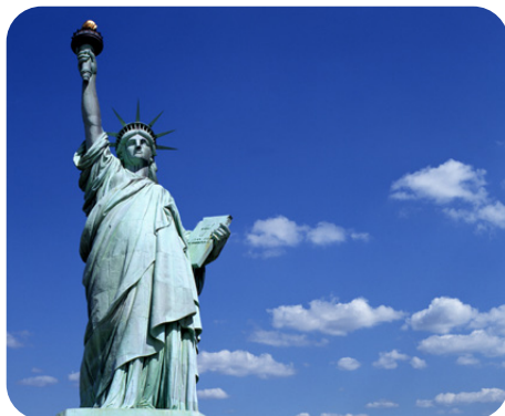
The Statue of Liberty, USA