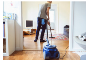
Cleaning and decorating the home Day 1