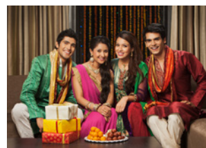
Brothers visiting sisters Day 5