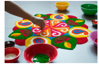
Rangoli Day 2