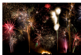
Fireworks and firecrackers Day 3