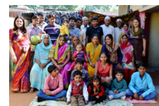
Family parties Day 3