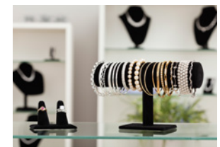
Buying kitchen items, new clothes and gold or silver Day 1