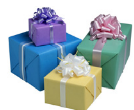
Giving gifts Day 4